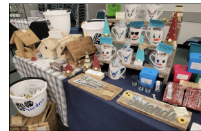
Mall in the Hall had all your shopping needs.

To view colored copies of the newsletter online, check out the Town of Macklin website: www.macklin.ca